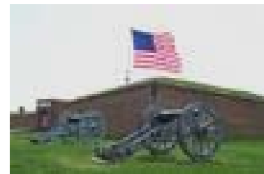
Fort McHenry Two field pieces in front of the fort with the Garrison Flag flying.

We finished off this reporting period with a fabulous Regional II Meeting hosted by Anne Arundel County. The programs were very interesting and very educational. The luncheon was delicious and returning to Snyder's is a must. My personal favorite though was the bake sale, some mighty fine bakers up there also. A good time was had by all of us. Thank you very much.